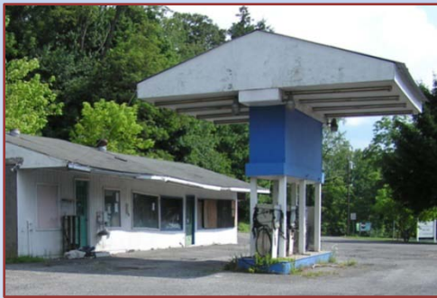
former gas station

abandoned eyesore with underground tanks near major intersection in heart of community