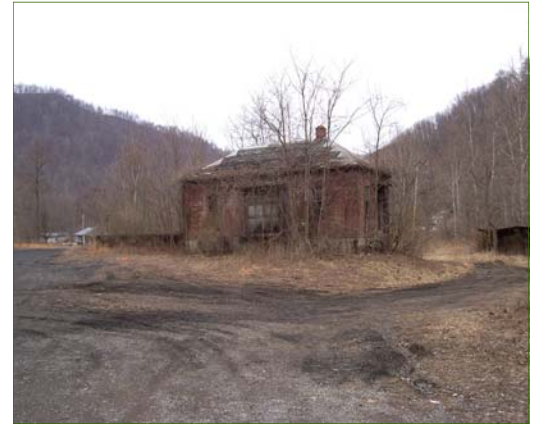
Efforts are on-going to renovate the abandoned Addison railroad depot into a historical museum, part of the Baker's Island Woodchoppers Festival renovation plans

Addison is currently evaluating the report to determine its next steps, which will include submitting an EPA targeted brownfield assessment application, and possibly an EPA brownfields clean-up grant.