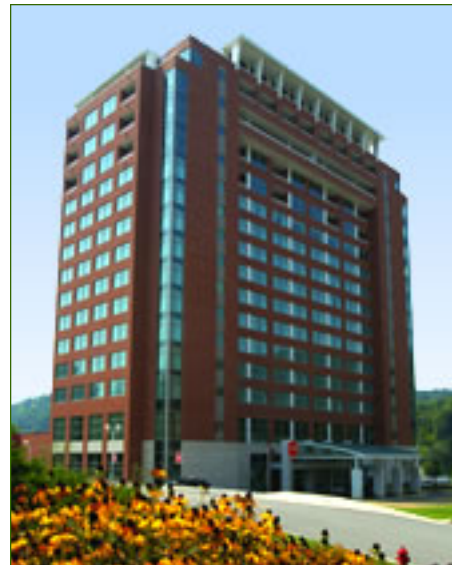
Waterfront Hotel and Conference Center, located along the Monongahela River in Morgantown, WV, will be the site for this year's WV Brownfields Conference

Conference registration and a draft agenda are available now on the West Virginia Brownfields website, located at: www.wvbrownfields.org . Conference sponsorship opportunities and exhibitor space are also available. Make plans now to attend.