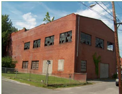
Rear view of former Patteson Building, to be converted to Coal Heritage Museum and office space

present in front of the building next to Main Street. The West Virginia Brownfields Assistance Center at Marshall University assisted the National Coal Heritage Authority in preparing a targeted brownfield application to EPA. The application has been approved for funding. EPA will hire an environmental contractor, experienced in subsurface site investigations, to determine if underground storage tanks are located on the site, and if any associated soil and/or groundwater contamination is present. Results of the investigation will be used to determine the next steps in moving the property forward toward eventual redevelopment. Stay tuned.