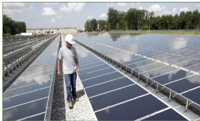
A worker checking on solar panels on a solar farm near Toledo, Ohio. A similar installation could eventually be considered on one or more of the many vacant former industrial properties in the Nitro, WV area.

"The Nitro solar evaluation project is 1 of 13 nationwide projects selected by EPA Headquarters and will be performed in partnership with the Department of Energy's National Renewable Energy Laboratory"