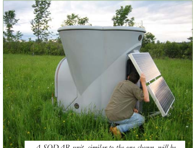
A SODAR unit, similar to the one shown, will be utilized for wind power analysis on former surface mine properties throughout central and southern West Virginia

"...grants of up to $50,000 each for alternative energy development projects"