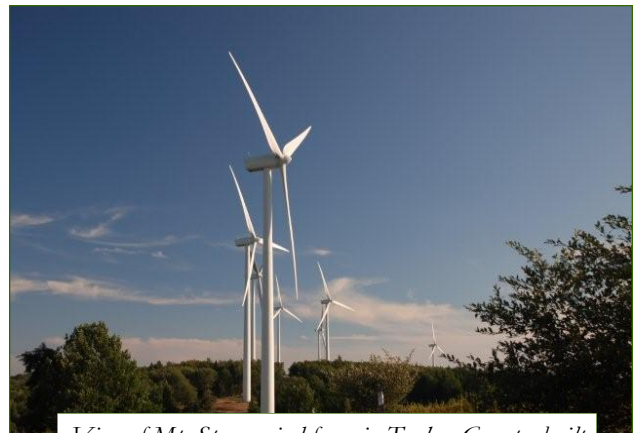
View of Mt. Storm wind farm in Tucker County, built partially on former surface mined property

Part 2 of this ARC-funded project involves providing funds for up to 6 mini-grants for alternative energy development projects. Each mini-grant has a maximum amount of $50,000 and requires 50% matching funds from the grantee. Alternative energy projects may include solar, wind, biomass, or similar applications. Funds can be used for a wide variety of applications, and are available to both public and private entities. Additional information, including RFP's, will be available in early 2010.